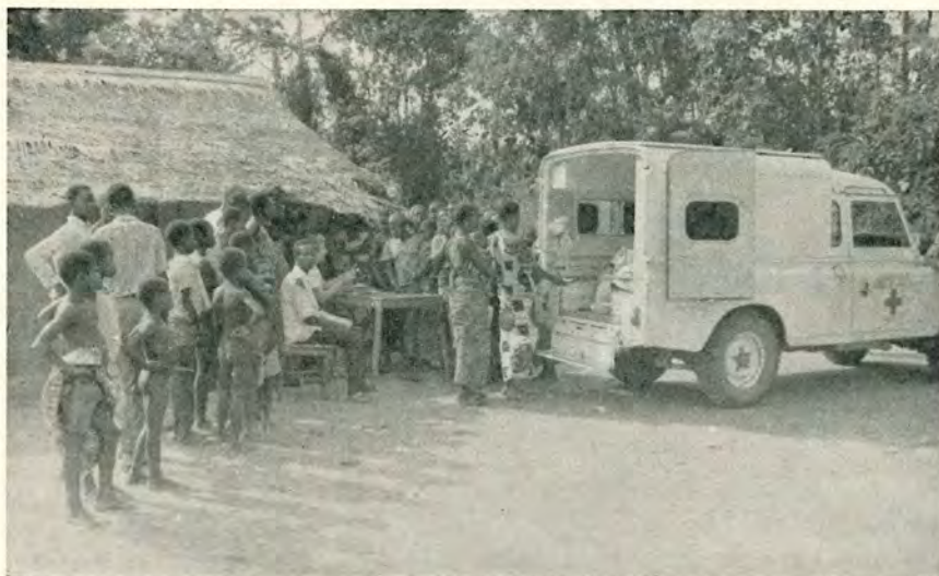
Selling books from the mobile dispensary at Yangambi, near Yakusu, Zaire

Times like a bereavement offer too the opportunity to identify with the people, taking part in their system of helping the bereaved family. Each person in the tribe and village must give a donation of 10p, the women clubbing together and the total handed over to the women of the family, and the men do likewise and giving their donation to the men of the family.