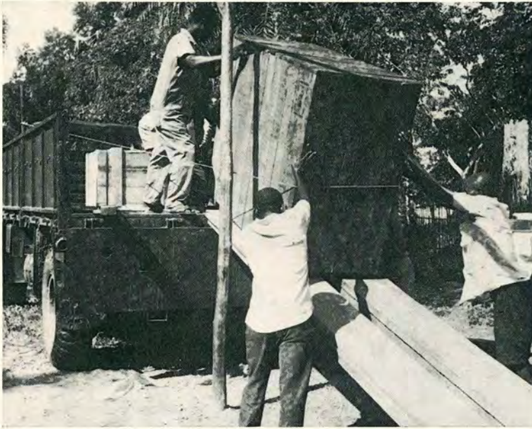
A new diesel generating set being unloaded by workmen at Yakusu, Zaire

of the Jehovah Witnesses whose salesmen come round very frequently on bicycles selling their books at what must be heavily subsidized prices.