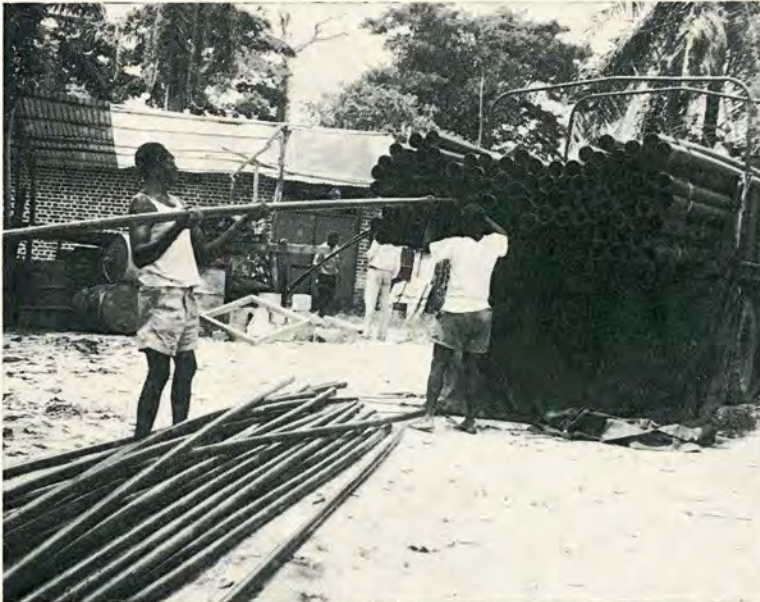
Some of the pipes used for the production of the water supply being unloaded at Yakusu, Zaire

Doreen West and Miriam Smith also play a part in the bringing of books to the people when they go out on clinic trips, and informing the pastors and evangelists of the books available and the new editions as they come in. This means that the written word is there ready for the people who are very thirsty for it and it means that the market is no longer at the feet