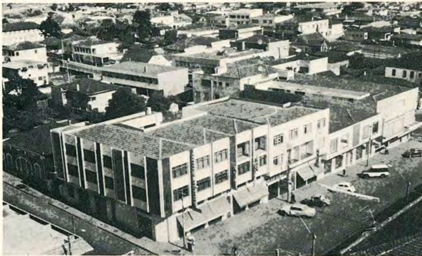
Guarapuava town centre, Brazil