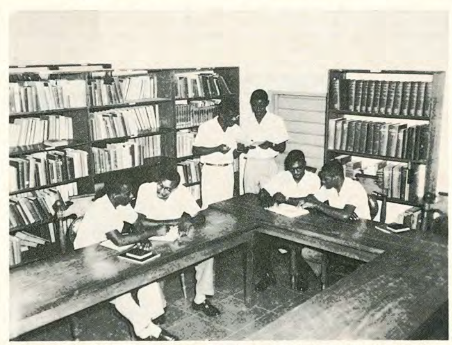
Students in the library of the United Theological College of the West Indies

Like many parts of the world today, the Caribbean is a region of newly independent states and young communities. While some