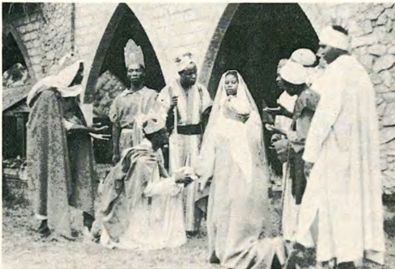
Nativity play in Zaire

As we approach the church, decorated for the occasion with palm fronds, we see crowds of people outside. Mothers with small children are sitting on the steps, so they can follow the service without their children distracting other members of the congregation. Teenage boys are leaning on the windowsills, looking into the church, since there is no room inside on this special occasion, all 800 seats are filled. All, that is, except for the space that has been reserved for us on a bench near the pulpit, and into which we squeeze ourselves as the hymn ends and the congregation sits down.