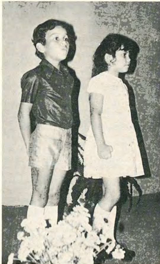
Children share in a Christmas service in Brazil

Conditions became so bad that a notice was read out over the local radio asking for people who would be willing to take the children . . . the notice was repeated quite a number of times.