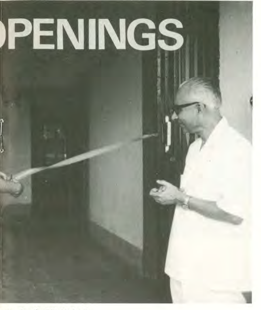
opening the Blind School

when they reach the age of 12. We are fortunate that the National Society for the Blind are opening a workshop and training centre for adult blind people three-quarters of a mile away from us. This is the first adult training centre in the country and it has been agreed that blind girls and women should also be able to train there. So maybe in a year or two some of our older girls will be learning to weave bandages or make chalk at the centre.