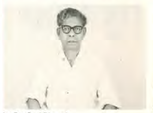
by Rev Paul Biswas*

Regent's Park Hall is open every day from nine o'clock until twelve in the morning and from four until seven in the afternoon. Bibles, Christian books, daily newspapers and magazines in both English and Bengali are available for anyone to read.