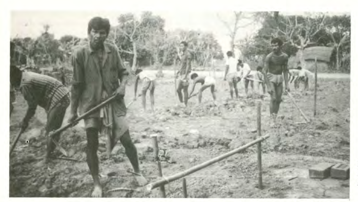
Digging the foundations for the new clinic at Malikbari