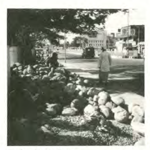
Road making in Dacca

Youth and Sunday School, social concerns, economic development, and family planning. All of these are aimed at service in the name of Christ and to the building up of the church.