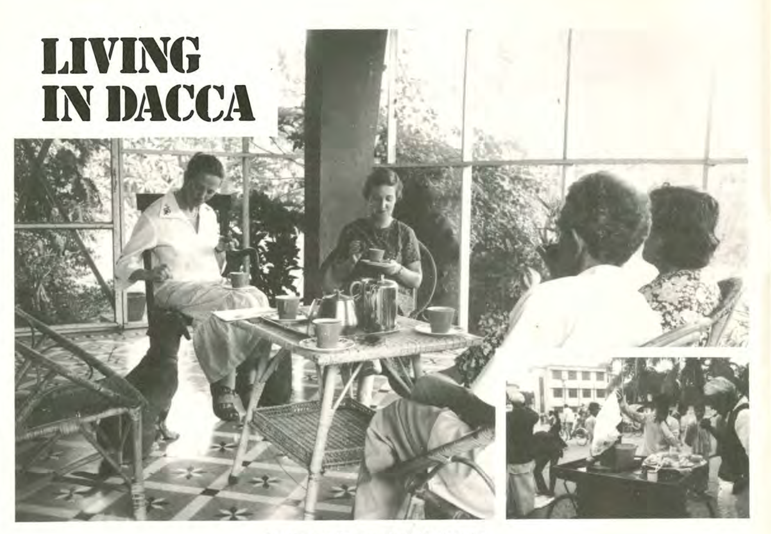
Tea time on the veranda and street scene in Dacca