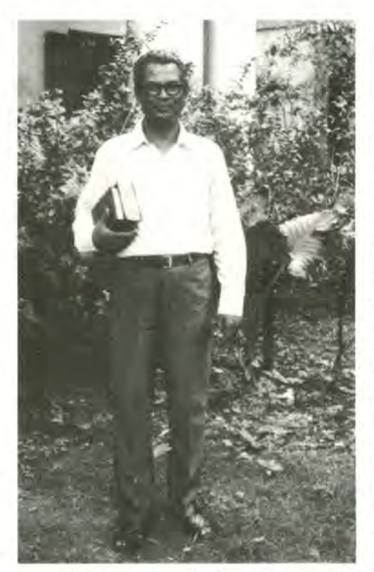
Rajan Baroi, Secretary of Bangladesh Sangha

The National Council of Churches has its headquarters in Dacca. It serves as a meeting place and focal point for many church bodies in Bangladesh and on occasions acts as the mouthpiece on behalf of the Christians in this country. It works in many different areas of the church's life. Women's work,