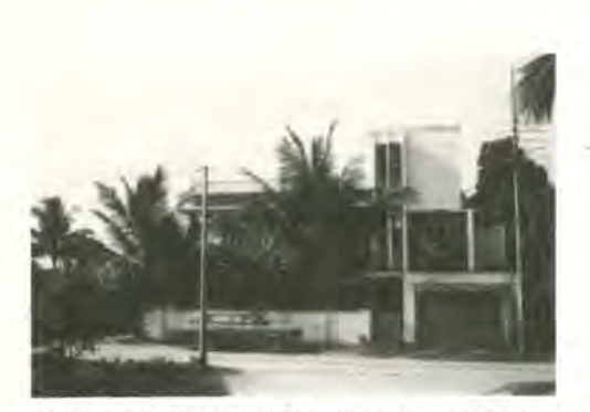
College of Christian Theology, Bangladesh