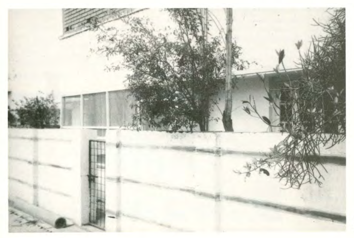
New Christian Centre for the blind in Dacca

Braille printing and in the reading room. Several sighted girls have been requesting classes so that they can learn Braille and there are many blind young women in the city who would attend day classes if we arranged them. The opportunities are endless; we just need the personnel and the time to train them to teach others!