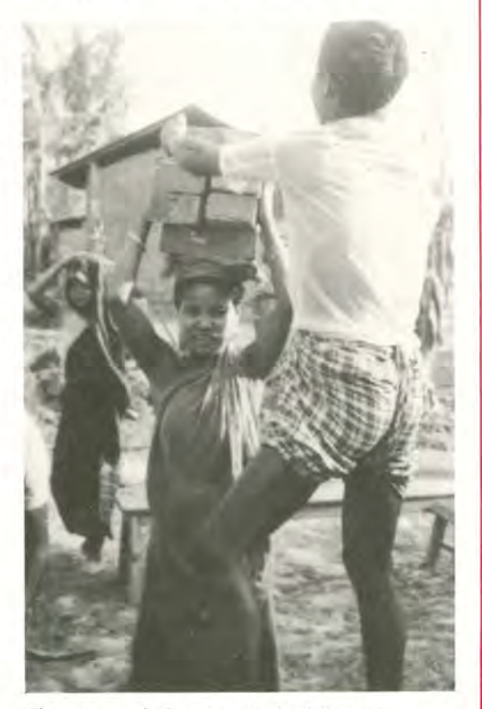
The women help with the building of the clinic

We have appointed a new pastor to care for the three Bengali village churches in our Dacca Baptist Union. These are all small churches and very far apart, entailing much travelling and battling on trains and buses to reach them but they are, none the less, important centres of Christian witness in their locality. One or two keen young men in two of the churches are greatly involved in outreach among their neighbours and one church has already decided to hold adult literacy classes nightly in their church.