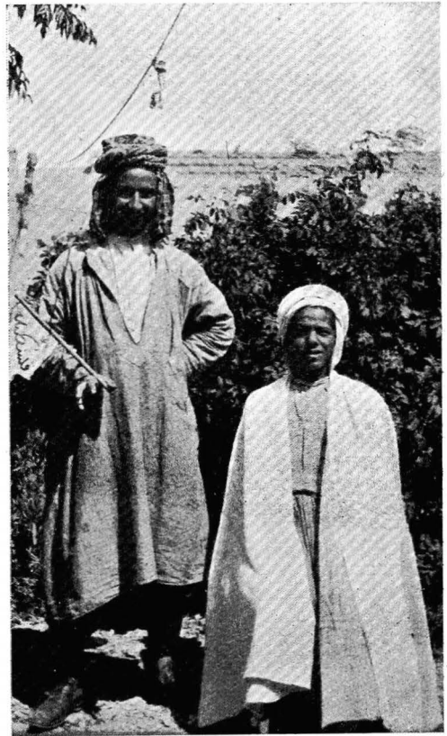
Two Young Converts at Tebessa.

October 25th. —We have such a nice girl staying with us just now. She came a day or two ago from her village to seek help for an injured knee. She tells us that her father died before she can remember, but her mother only died last year, and since then she has been living with some relations. Some time in the early