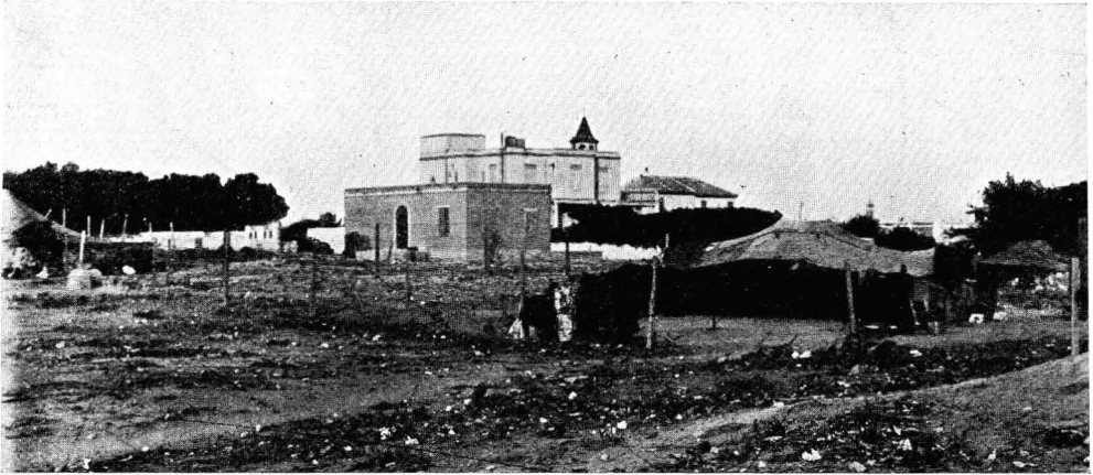
The Tent in which the Little Boy Died.