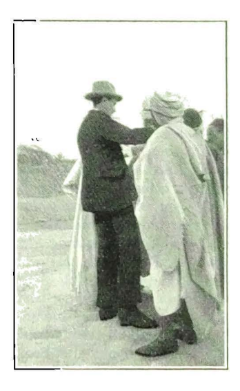
At the Landing Place.

The records of the past year witness also to the power of the Holy Scripture in