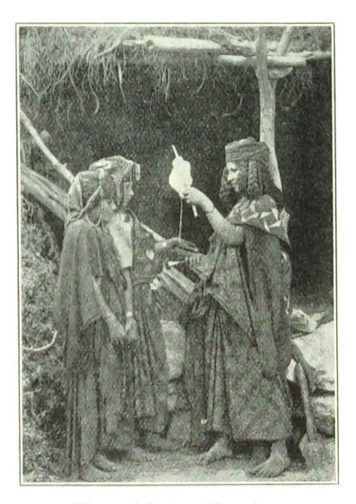
Women of the Aurès Mountains.