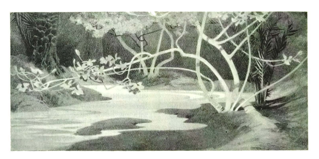
The First Outflow of the Tozeur River.

The converse is true. If by our unbelief we limit the Holy One of Israel, if we quench the Spirit, if we thwart Him by our obstinacy, our apathy, our slowness of heart, we shall be confronted at the Judgment Seat of Christ by the "left undone." For our life's possibilities have been