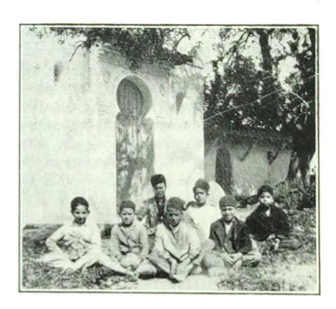
Still in Darkness. Boy Visitors at a Colea Shrine.