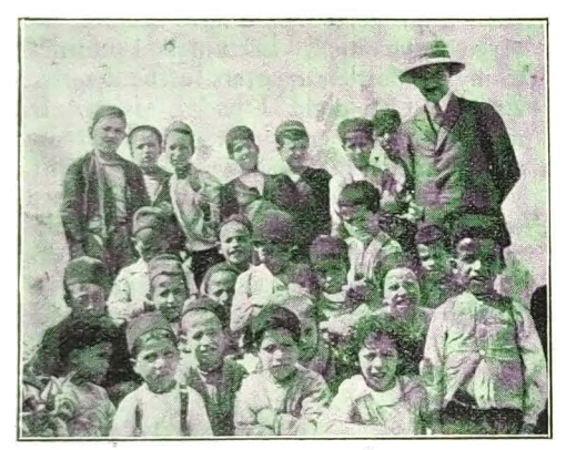
A Typical Boys' Class.

No Sunday is ever quite like another, but each one is a day with many possibilities of service and of proving that "there is joy to tell the story." M.H.R.