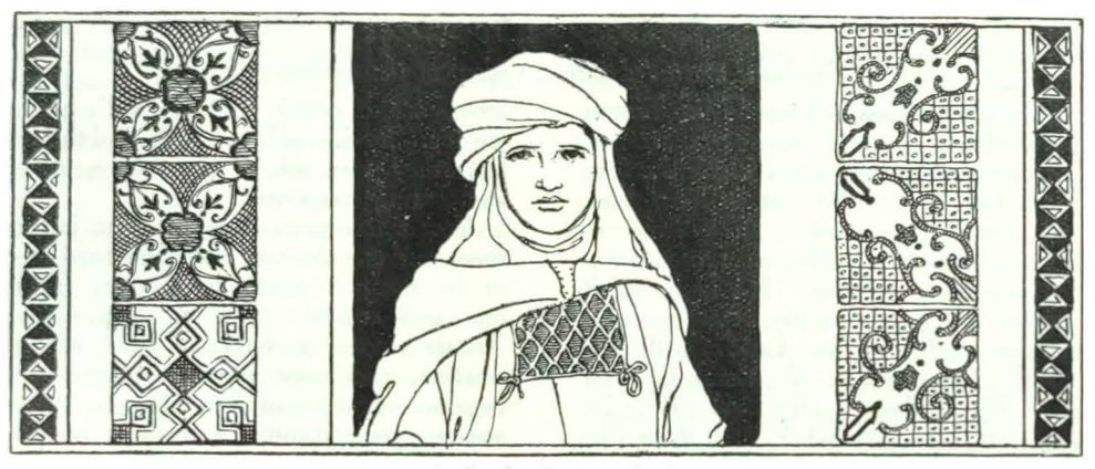
A South Country Lad.