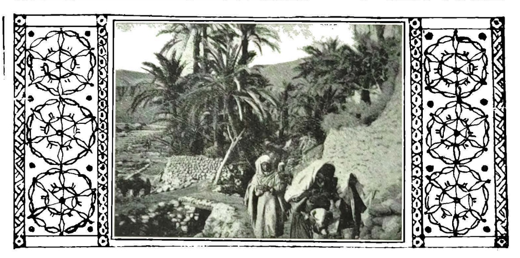
In the Aures Mountains.

French woman, who booked our places, that the chauffeur would tell us beforehand if the route were not safe. She also promised us a warm welcome from the Caid of the village with whom we would require to lodge until we could get a bus on to Biskra.