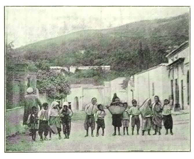
Road leading to Mission House-Blida.