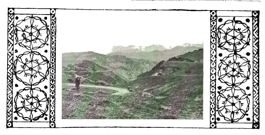
On the Road to Médéa.

mother showed us into the cool guestroom and she and a negress gave themselves up to listening with quiet intensity.