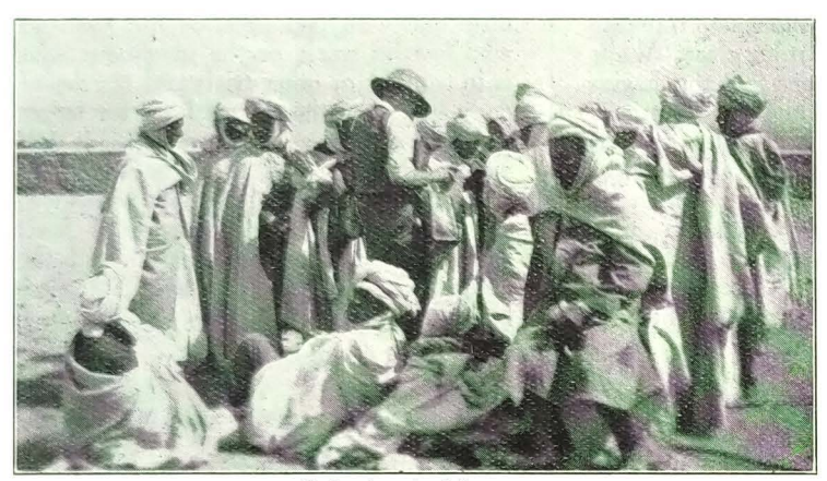
Delivering the Message.