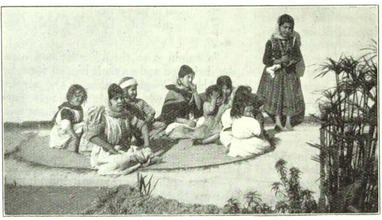
Group of Tlemcen Girls.

burned with joy over some words in a hymn promising forgiveness "to-day" to those who repent and believe because of the atoning death of Jesus Christ. As we watched the struggle in her heart and life we rejoiced over the silent decision we believe was being made. She