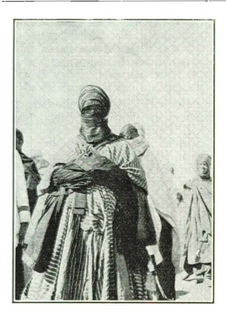
THE KING OF THE TUAREGS, THE VEILED MEN OF THE DESERT.

beyond sand and dunes, and though my two tyres were all burst up, the tarred roads enabled us to reach our destination, by going softly.