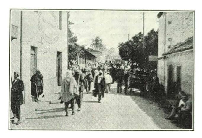
THE STREET OF THE BOOK DEPOT, COLEA. (The Depot is under the palm on the left.)

It is of the latter kind of sendings that it is our privilege now to tell. We believe that the true interpretation for many who have come into the book depot at Colea is that already there had been a convicting touch of the Holy Spirit, Who continues on earth Christ's shepherd work of seeking the lost. The beginnings of such work are hidden from our view. "The Spirit breatheth where He listeth . . . so is everyone that is born of the Spirit," albeit may we not believe that He uses many of the scattered portions of His Word throughout the land, for this His first work?