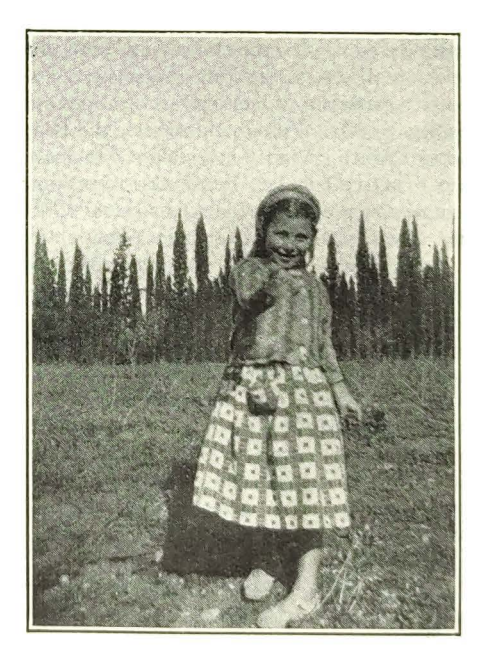
A MEMBER OF THE CAMP.