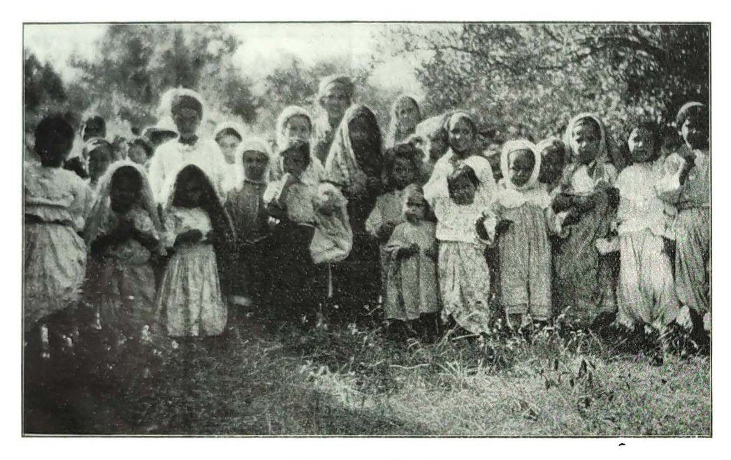
"NEWNESS OF LIFE."