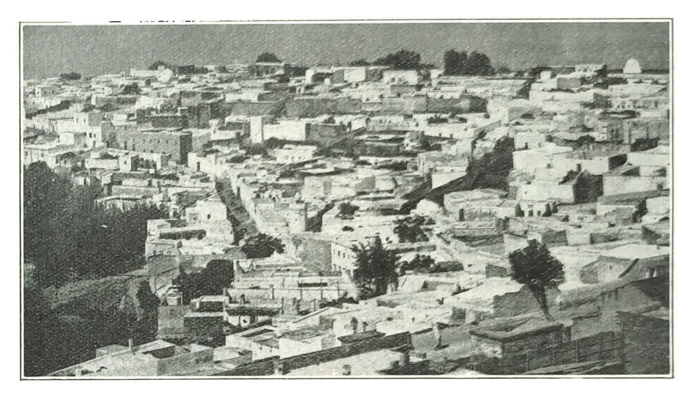
A VIEW OVER MOSTAGANEM.