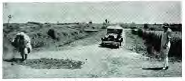
"Only a big stone"

Once again it was a very hot day and this time I was in a hot country. I was travelling in a car across the central plain of Morocco. Mile after mile, the road stretched before us, white and glaring in the sunshine, with never a tree to give us some shade. Suddenly there was a bang. What was that? A burst tyre, something broken in the engine?