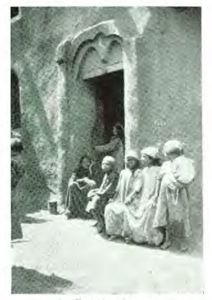
An Egyptian Doorway

After the class and a little more friendly chat we make our way home across the fields again after putting our heads into most of the other doorways with a greeting for anyone