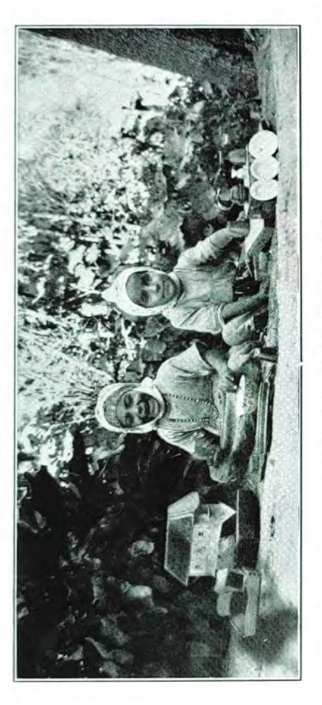
"Two little Arab Girls" (see page 14)