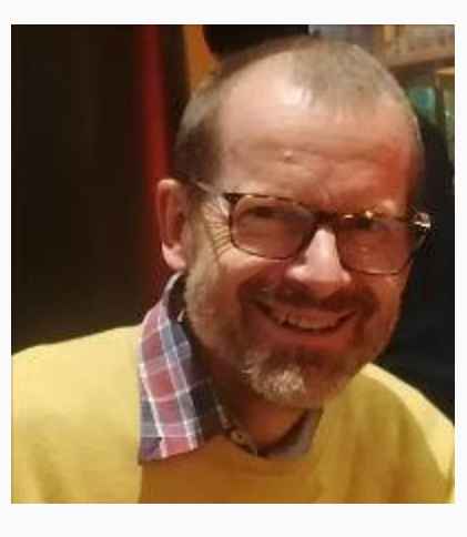
Theological Education with an Indigenous Gait, Africa.