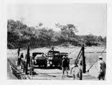
STANDARD OIL COMPANY'S FERRY. RIVER PILCOMAYO.