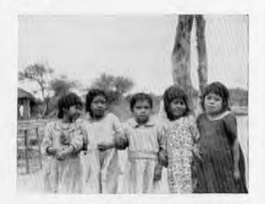
SCHOOL CHILDREN. MISSION STATION.