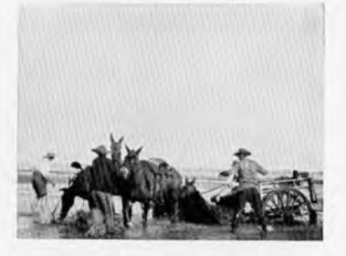
QUICKSANDS. RIVER PARAPET. facing p. 80.