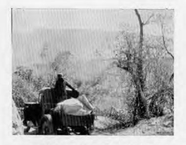
AMONG WOODED HILLS.