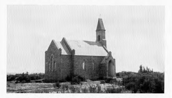
ST. DAVID'S CHURCH, UPPER VALLEY, CHUBUT. facing p. 166.