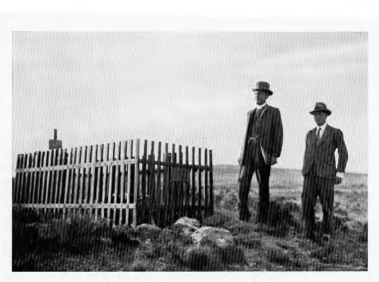
OFFICER'S GRAVE AT SAN JULIAN. VOVAGE OF H.M.S. BEAGLE 1831-36.