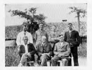
GROUP AT MISSION STATION 1931.