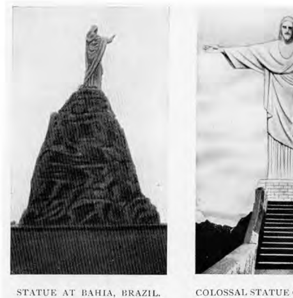
COLOSSAL STATUE ON CORCOVADO MOUNTAIN.