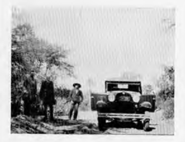
A ROAD IN GOOD REPAIR.