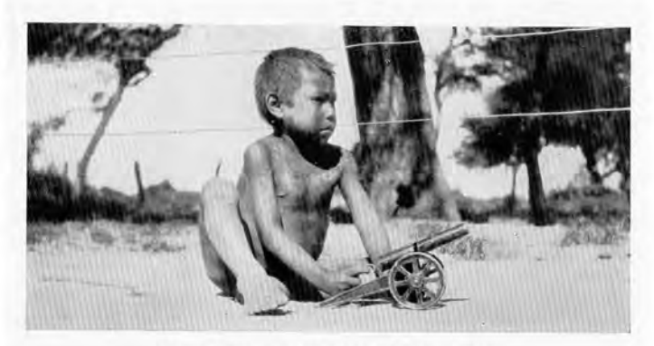
TOBA CHILD AND MECHANICAL TOY.