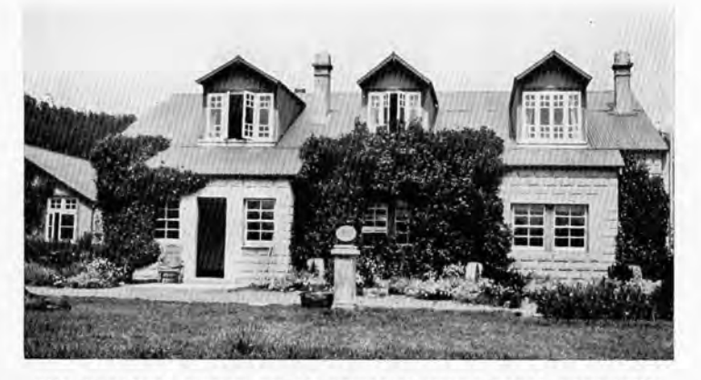
THE ESTANCIA HOUSE ON AN ENGLISH SHEEP FARM, PATAGONIA. facing p. 168.