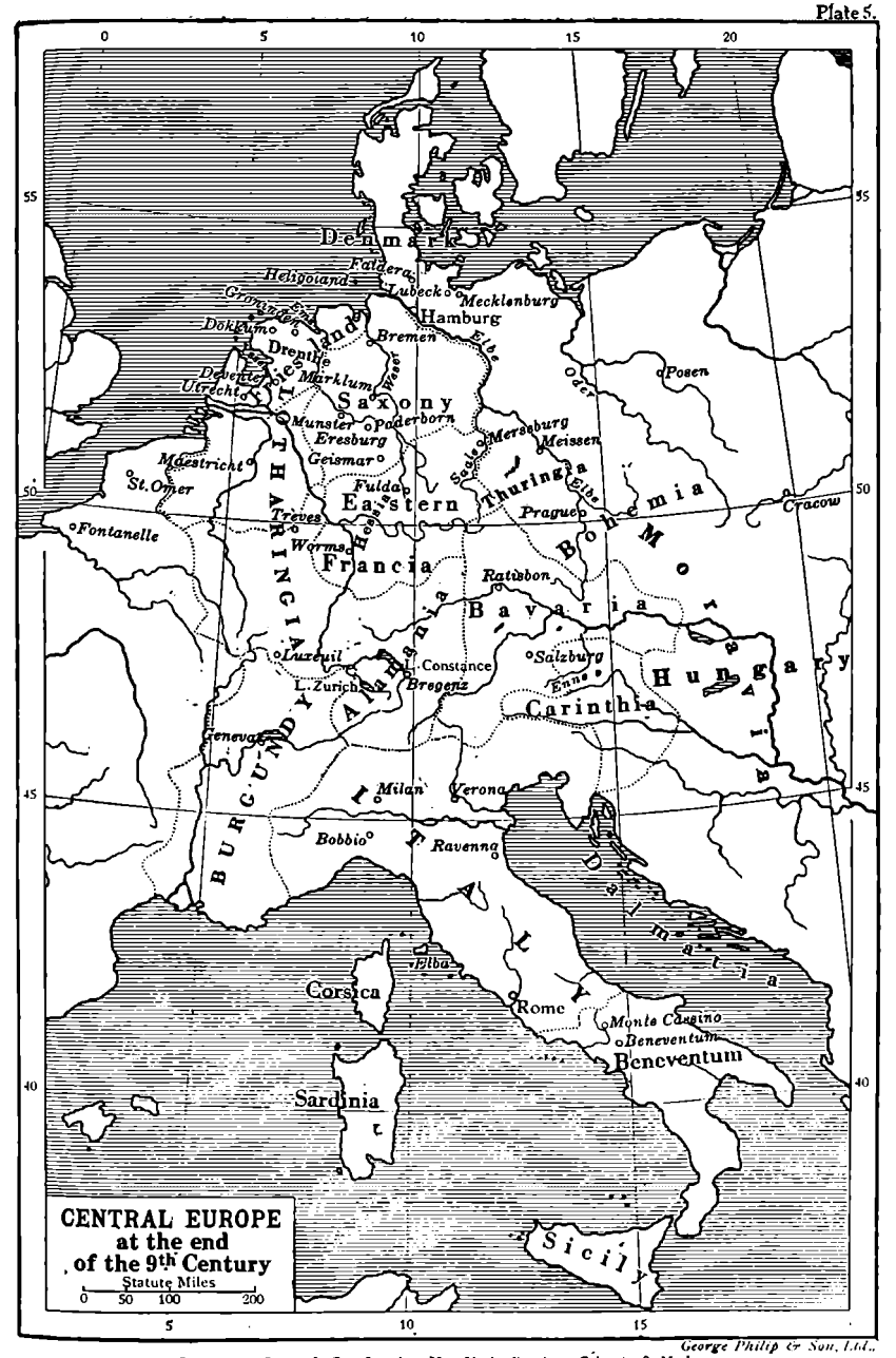
Longmans, Green & Co., London, New York, Bombay, Calcutta & Madras.