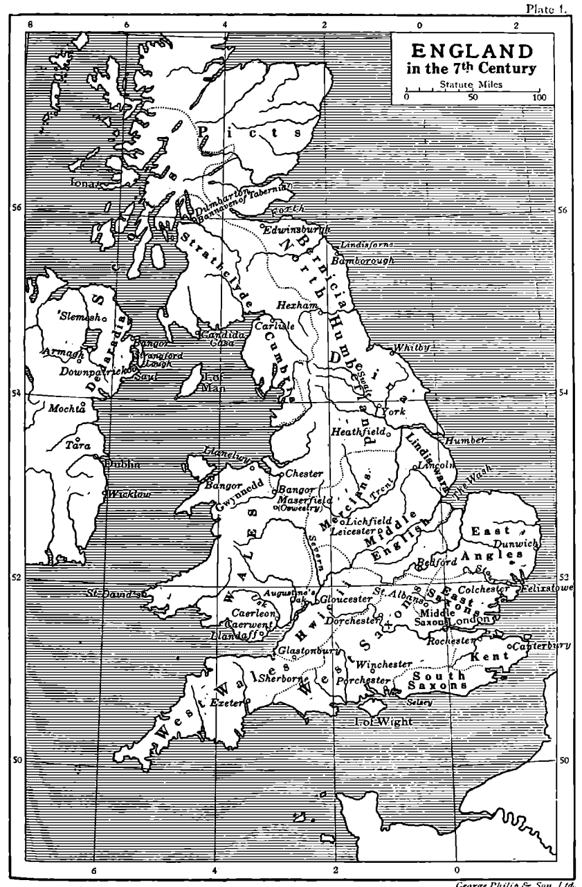
George Philip & Son, Ltd. Longmaus, Green & Co., London, New York, Bombay, Calcuita & Madras.