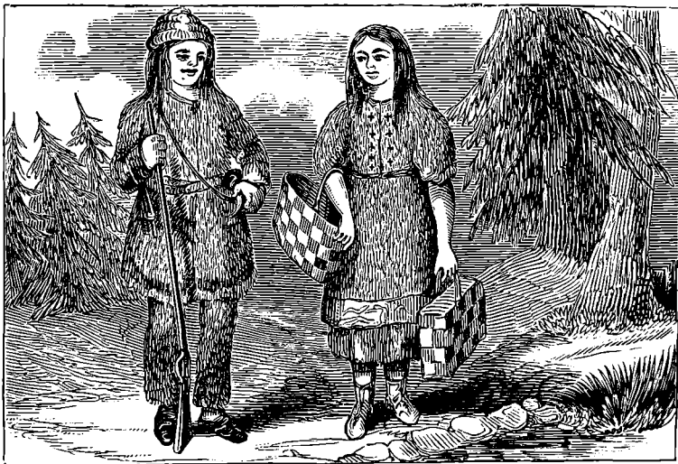
NORTH AMERICAN INDIANS, OF THE MONSEC TRIBE, ON THE THAMES RIVER.