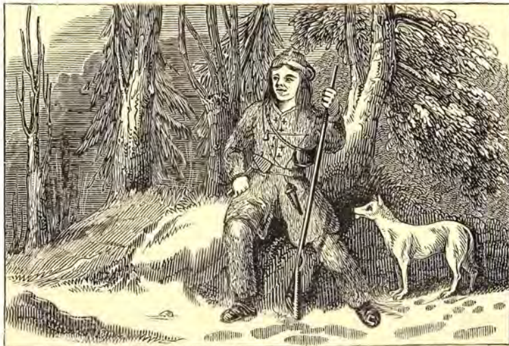
NORTH AMERICAN INDIAN, OF THE CHIPPEWA TRIBE, ON THE THAMES RIVER.