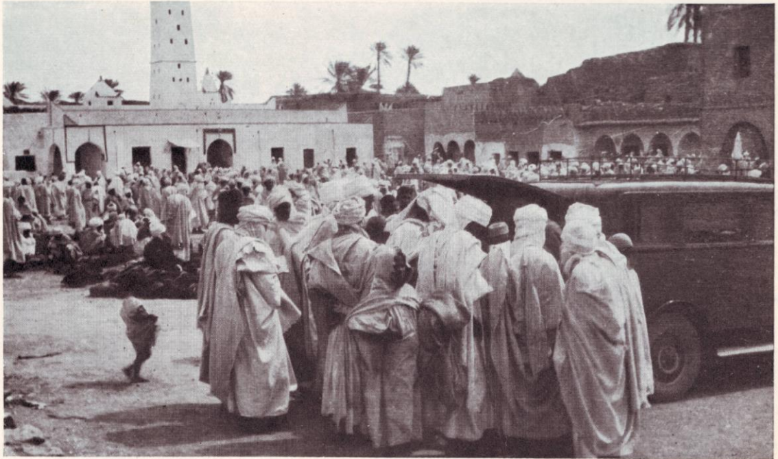
OUR N.M.P. BOOKSTALL-CAR WELL-PATRONISED AT A SAHARA OASIS