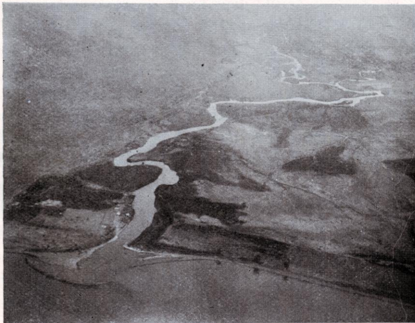
RIVER JORDAN ENTERING LAKE

Photo by Dr. Torrance, at 2,000 ft., 100 m.p.h.!