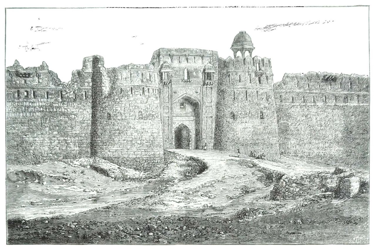
POORANA KILLAH-OLD FORT, DELHI.-(From a Photograph.) (See page 8.)