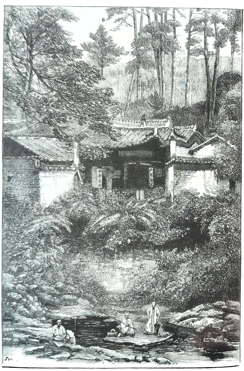
THE RESIDENCE OF CHU FU-TSZE.—(From a Photograph.)