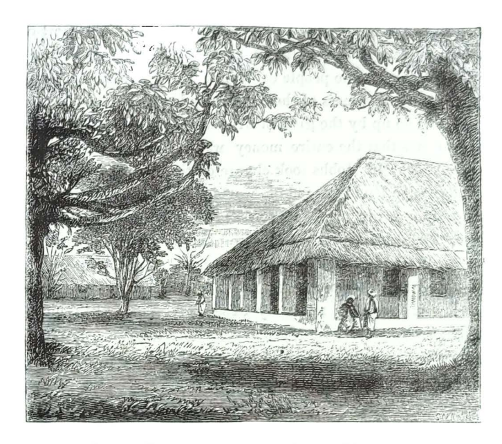
The Soory Baptist Chapel.