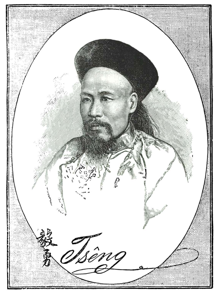
HIS EXCELLENCY THE CHINESE AMBASSADOR, THE MARQUIS TSENG, Minister Plenipotentiary and Envoy Extraordinary to Russia, France, and England.