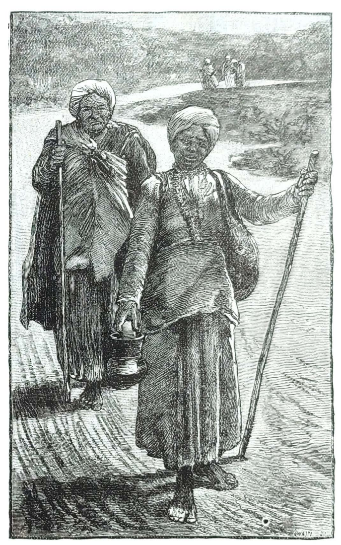
PILGRIMS OF JUGGERNATH.—(From a Photograph.)

a salvation—a salvation which means a change of heart , and not simply a change of outward forms—even when it has been offered, we cannot marvel that left to himself man should weary himself in seeking for deliverance. In a heathen country like India, we see many of the varied plans which