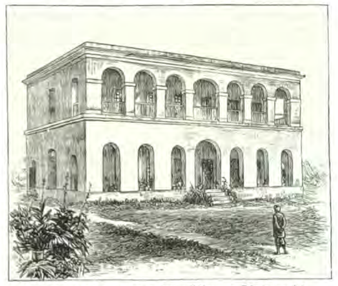
FURREEDFORE MISSION HOUSE. - (From a Photograph.)

"Sundays are busy days at the mission-house. In addition to the services held in the native chapel, there are classes in English for the students of the large Government school. Text cards and pictures are given to the smaller