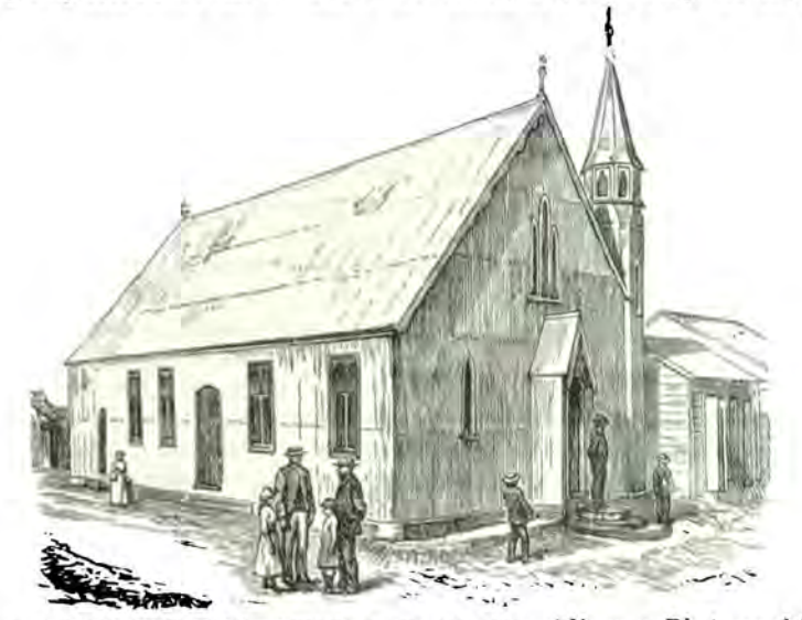
BANTO DOMINGO MISSION-PUEBTO PLATA CHAPPEL.-(From a Photograph.)

The Island of Santo Domingo is one of the largest of the West Indies. being only second in size to Cuba. It boasts, too, of having the highest