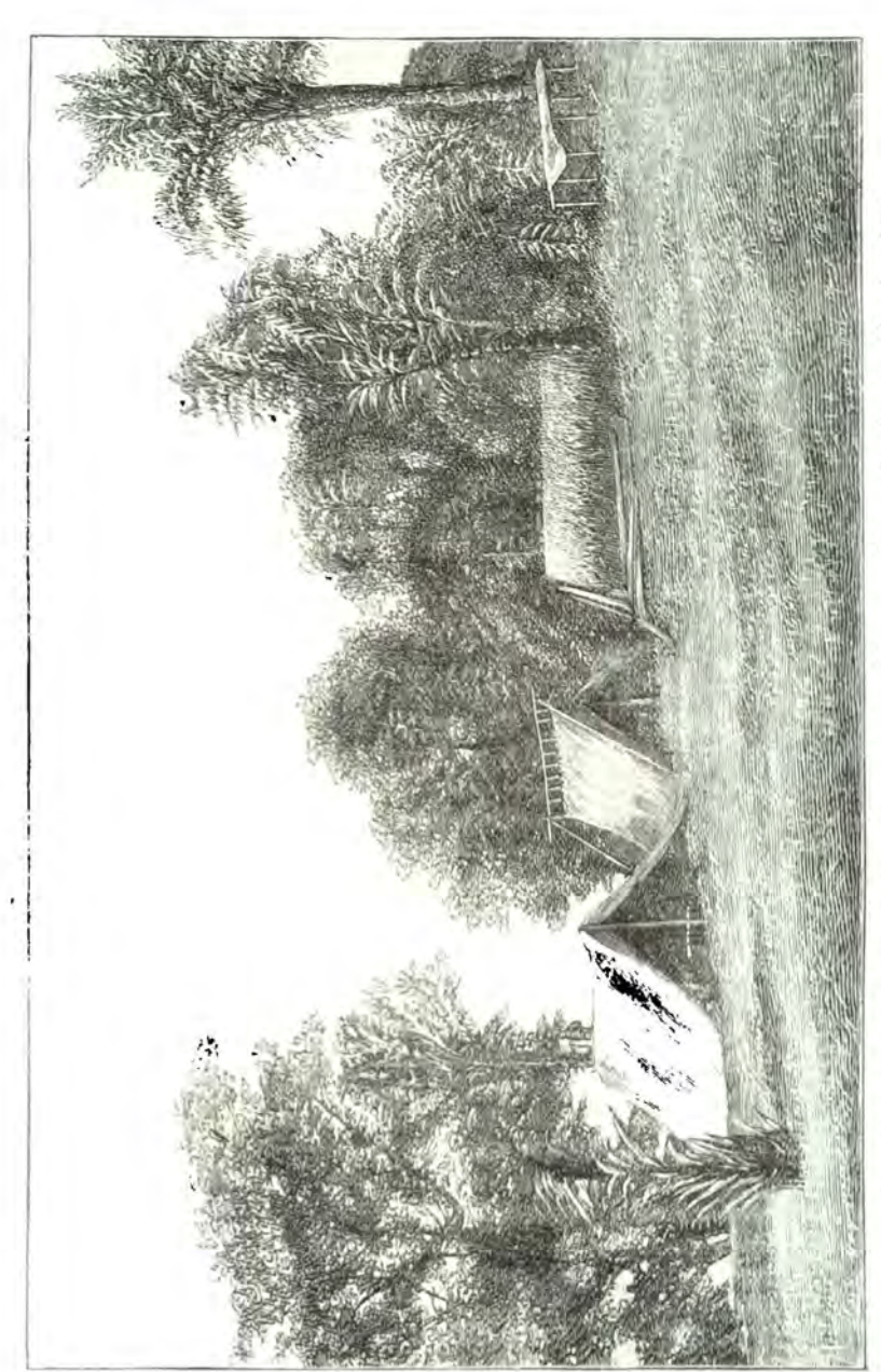
NEW STATION AT BOLODO, TPPER CONGO RIVER .-