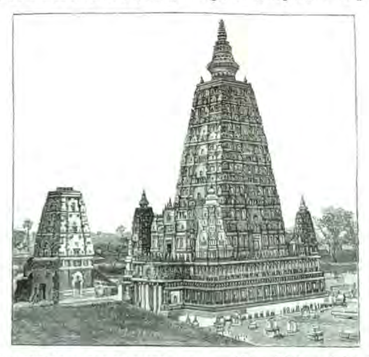
THE TEMPLE AND MONASTERY AT GYA.—(From Photograph No. 2.)

"The dead bodies of the monks, unlike those of other Hindus, are buried, and the cemetery contains the graves of about two hundred persons. The body is buried in a sitting posture; and in the case of mere novices a small circular mound of solid brickwork, from three to four feet high, is all that is deemed necessary for a covering for the grave. For men of greater consequence a temple is