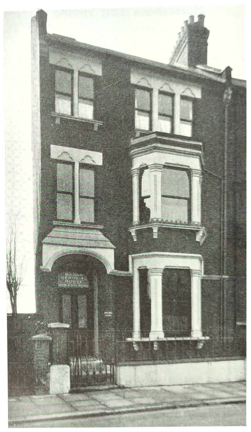
OUR NEW HEADQUARTERS