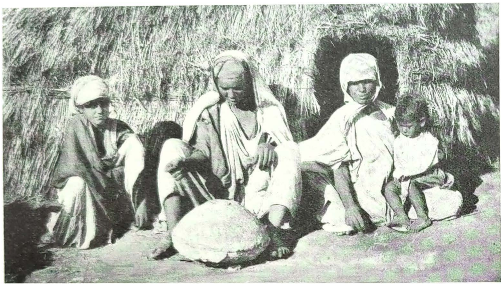
[From a post card.